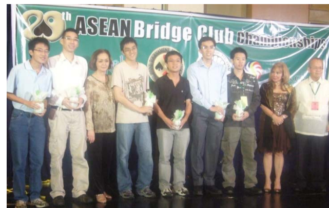
The GG team at ASEAN 2008