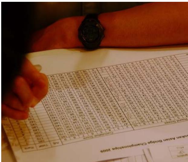
Thanks to SCBA for a well organised event!