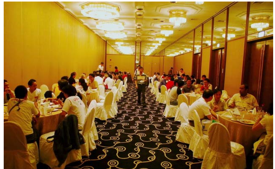
Participants enjoying a wonderful Sunday lunch!