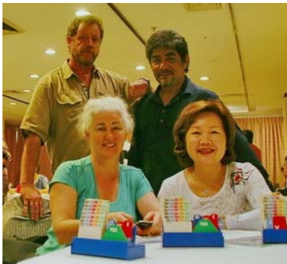
A record number of overseas players joined the Pesta Sukan, from Malaysia, Indonesia, and even France