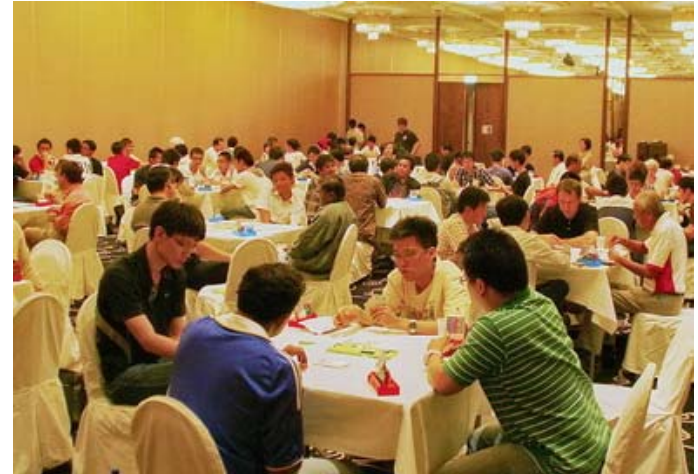
The level of concentration was palpable